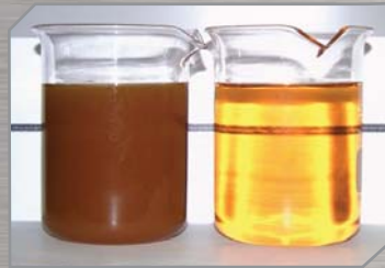
85W140 GEAR OIL