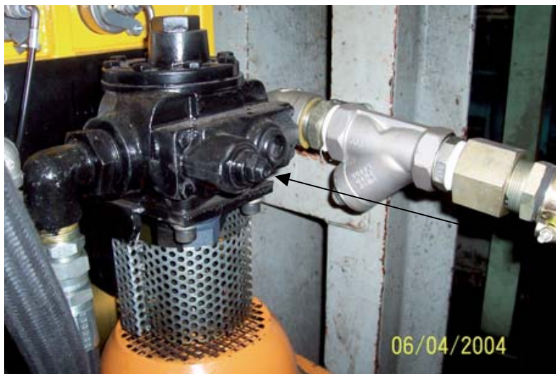
Relief Valve adjusting Screw

The pressure is adjusted by firstly loosening the lock nut on the relief valve with a \frac{3}{4} " AF ring spanner and whilst holding the nut, screw in or out the adjusting screw with an Allen key until the desired pressure has been reached.